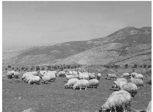
Sheep near Mount Hermon, Israel

“The grand climax is the book of Revelation, where ‘the Lamb’ as an epithet for Christ appears twenty-eight times.” (Leland Ryken)