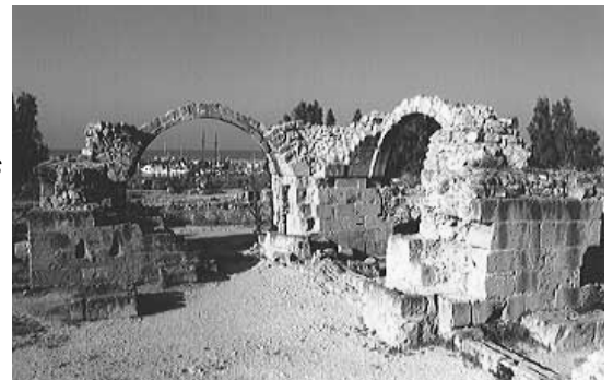
Ruins of Cyprus

“One motivation is worth ten threats, two pressures, and six reminders.” —Paul Sweeney